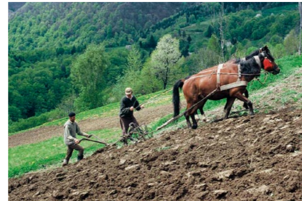
Natural resources – forests, agricultural and pasture lands, livestock and water – provide the base for livelihood for millions of rural families in developing and transition countries.